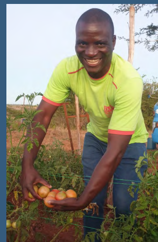
In the model gardens, the farmers grow many different crops.