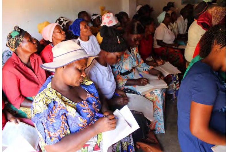
Farmers receiving education about water irrigation systems.

We look forward to sharing updates on this project and its impact on the communities in Chimanimani, Zimbabwe.