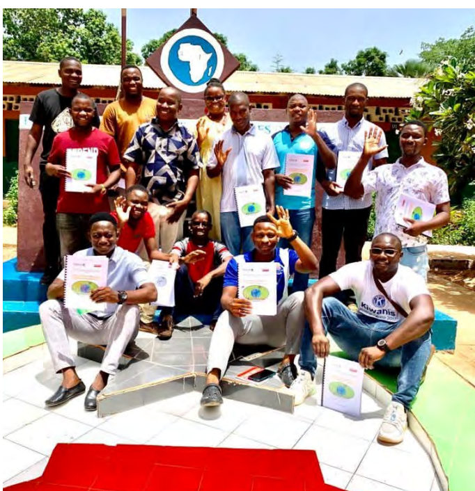
Students pose with a manual on environmental health.

The Teacher Training College in Bachil, Guinea-Bissau, has been working with an initiative that focuses on the connection between environment and health, since the end of 2023. The program is about the health of both the individual and our planet, and trains teachers through interdisciplinary courses that promote environmental engagement and social responsibility. The goal is to develop effective, inclusive and concrete solutions, which teachers can share with the most vulnerable people living in rural areas, who are close to the effects of climate change. Teachers are trained to develop initiatives tailored to the specific needs of their local communities to promote the environment, health and climate resilience. We look forward to following the further development of the project.